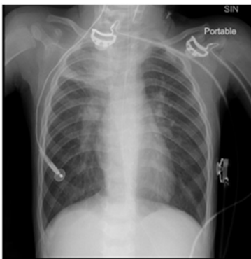
Chest radiograph (anterioposterior view) of the patient on the first day of hospitalization, showing upper right-side pneumonia

Conclusion: Presence of HBoV1 DNA in whole blood and cell-free blood plasma shows that virus is not only present in respiratory tract but is also circulating in the blood. To our knowledge this is the first time HBoV1 mRNA has been detected in PBMCs, suggesting active replication in PBMC.